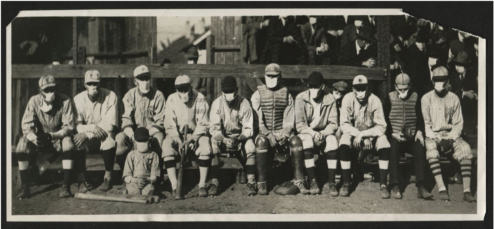
Major Leaguers wearing masks, exhibition game, Pasadena, CA, January 26, 1919. Spanish Flu epidemic, February 1918 – April 1920